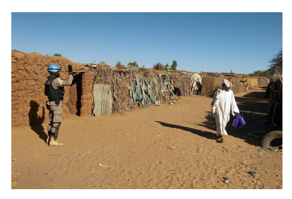
UNAMID peacekeeper patrols a village in Darfur to ensure security of his colleagues

unrest. Although there were no arms found after the attack, no independent investigation to identify responsibility of the GoS or that of UNAMID has been conducted. A GoS military source has reportedly declared that UNAMID is the party to be questioned for the attack on Kalma camp and that UNAMID gave GoS the green light to dismantle and neutralize the threats in the camp.