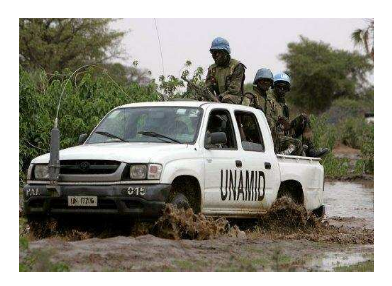
UNAMID soldiers Moving onto difficult terrain, August 2009

Assembly in respect of grave circumstances, namely: war crimes, genocide and crimes against humanity.<sup>#10</sup> The main AU organ that leads its political and military efforts in Darfur is the Peace and Security Council. In its intervention in Darfur, the AU was driven by its slogan of "African solutions to African problems." Such slogan is appealing to pan-Africanist groups and institutions as it carries with it a sense of pride, responsibility and initiative. However, the AU decision to shoulder the heavy burden of Darfur was advanced by Sudan and its allies within the AU for ulterior motives. Soon after the AU's disciplined and courageous stand on Darfur, the continental body faced mounting odds. The international community also used Sudan's fervent advocacy of a predominant African character of any peacekeeping force in Darfur as a pretext to devolve responsibility to address this challenging situation to the AU member States. The AU intervention in Darfur is mainly confined to: 1. the deployment of a military force to observe the ceasefire arrangements and eventually to protect civilians; and 2. the mediation of a negotiated political settlement of the armed conflict.