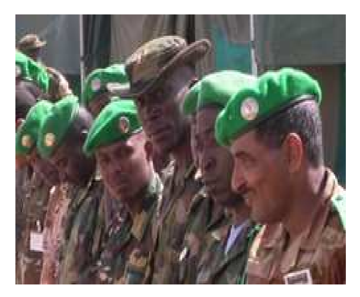
AMIS Soldiers in South Darfur by Derk Segaar (2005)

In short it can be asserted that the protection, humanitarian and political tracks entrusted upon UNAMID by the international community have not generated the required positive result. There is no doubt that UNAMID's mandate, composition and capabilities are responsible for the little progress that it has achieved so far. Nonetheless, the major impediment remains the resistance of GoS to effective deployment of UNAMID as well as the diplomatic and political support that GoS continues to receive from Africa, the Arab and the Islamic countries despite the almost universal unanimity of opinion that the presence of a robust and capable UNAMID would have salutary effect on the victims of the armed conflict in Darfur.