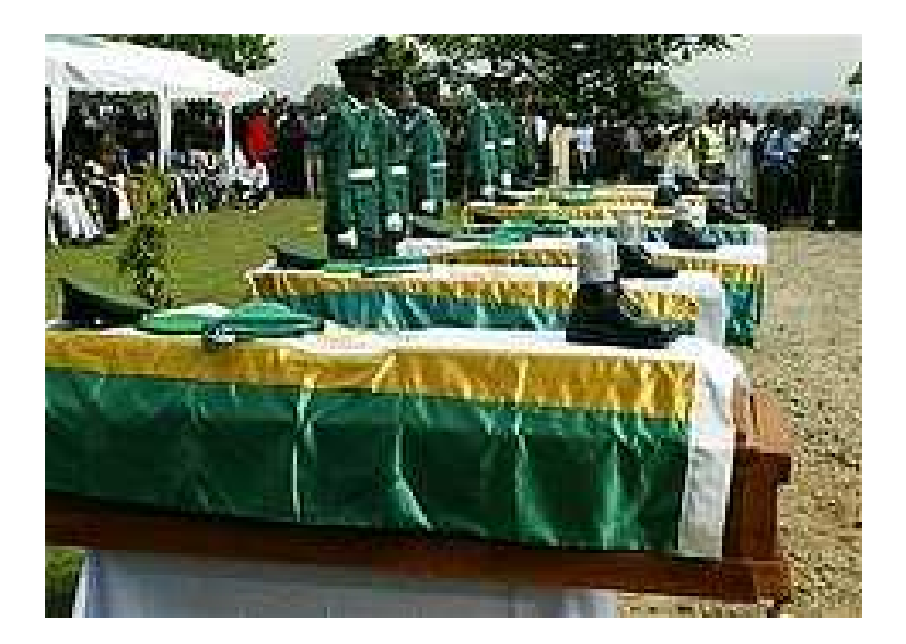
Burial ceremony of 7 AMIS soldiers from Nigeria killed in Darfur, 5<sup>th</sup> October 2007.

It was observed that attacks against mobile UNAMID forces are premeditated, wellplanned and punctual and that such attacks appear to be facilitated by prior knowledge of the timing and routes used by UNAMID troops in their movement, which is information usually shared by UNAMID with the parties to the conflict in Darfur in advance. It was also observed that the overwhelming majority of the deadly attacks against UNAMID were committed in areas under the control of GoS or in areas that witness active presence of GoS's Janjaweed allies or Sudan Liberation Army/Movement (SLA/M) factions that signed peace agreements with GoS.<sup>8</sup> Some of these attacks were even committed inside the major cities in Darfur including EI-Fasher, which is the seat of UNAMID Headquarters. See Annex One for a non-exhaustive list of attacks against UNAMID forces in Darfur between January 2008 and June 2010.