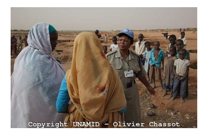
UNAMID speaks to internally displaced persons (IDPs) in Abu Shock IDP camp.

government decision in courts of law. On 21<sup>st</sup> April 2010 the Khartoum Administrative Appellate Court ruled that the GoS's decision to revoke SUDO's registration has no legal ground and that HAC has no authority to dissolve SUDO. The Court ruled that all subsequent acts imposed on SUDO are null and void and ordered GoS to allow SUDO to continue its activities as an NGO registered according to existing Sudanese law. GoS is yet to return SUDO's property or allow it to resume its work. The continuing expulsion of NGOs from Darfur and closure of national human rights advocacy organisations does not only deprive people in need of humanitarian assistance of live-saving material like food, medicine, shelter, clean water and sanitation, but it also jeopardises human rights protection, monitoring and reporting in the region.<sup>39</sup>