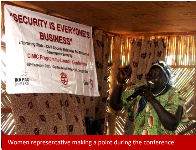
Women representative making a point during the conference

The women expressed their bitterness against the men on the destruction gun violence is causing to them as women in Jonglei State. Emphasizing that, men are the sole perpetrators in the on-going conflicts and gun violence in Jonglei state. They (women and children) carry the burdens, when it comes to taking stock of the impacts. The women stressed that perpetrators of violence should be identified and dealt with properly in accordance to the law. The women at the same time appealed