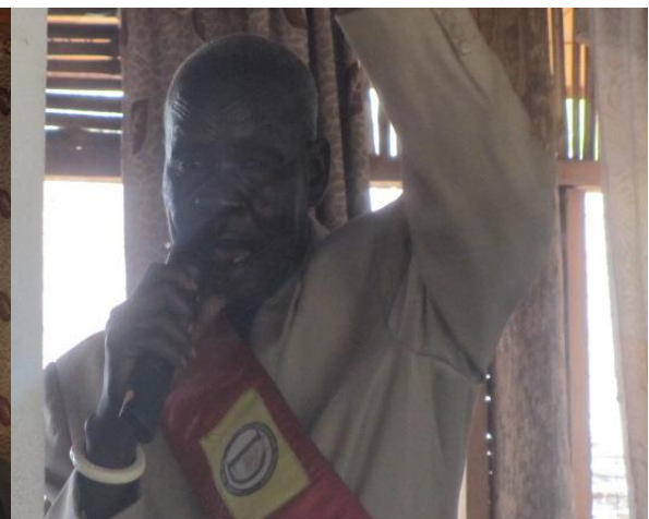
Paramount Chief of Duk County – Chuei