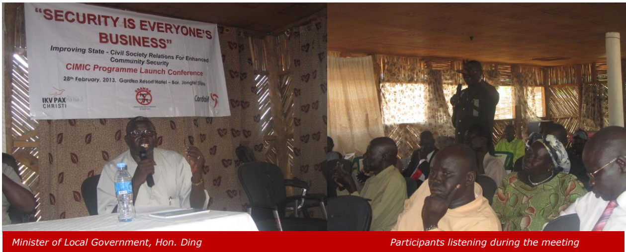
Minister of Local Government, Hon. Ding