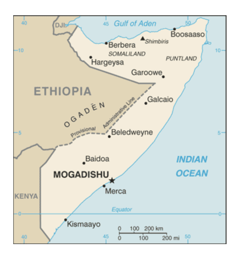
24 - 30 November 2014