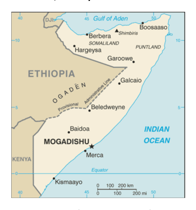
November 20th - November 27th, 2013