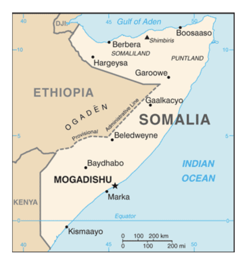
2-9 November 2014