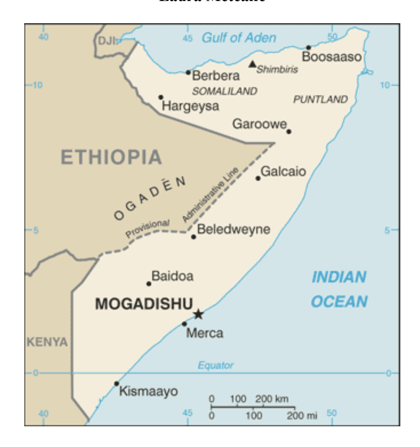
17 – 23 November 2014